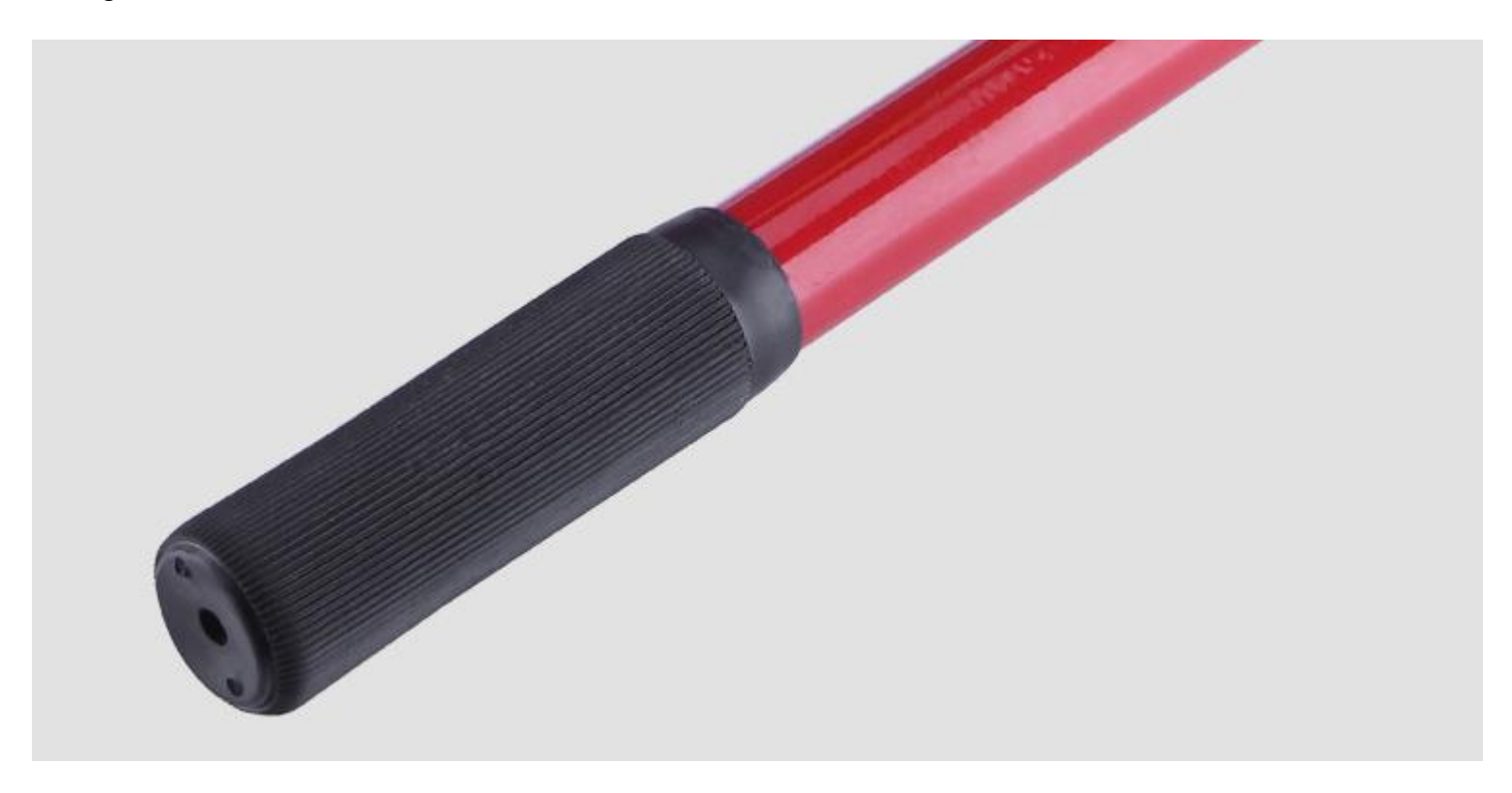
The 2 Ton Low Profile Jack uses thicker steel plate and thicker material, which is safer to use, more stable and safer in structure

The 2 Ton Low Profile Jack uses a mechanical handle, which makes it easier and more labor-saving during use