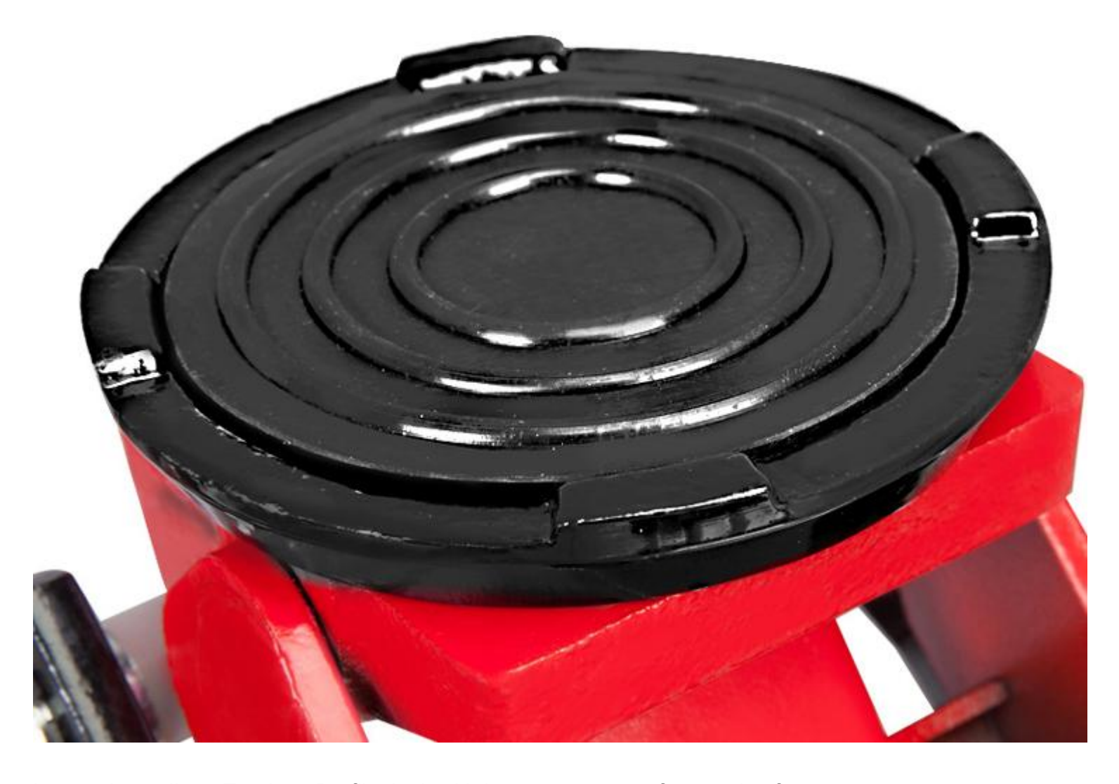
Large-size pallet 2 Ton Low Profile Jack with larger contact surface and safer

The 2 Ton Low Profile Jack has a safety valve design, which automatically protects when overloaded to avoid accidents